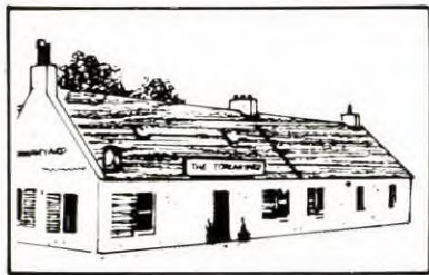
The Torranyard (near Irvine) Telephone: Torranyard 221