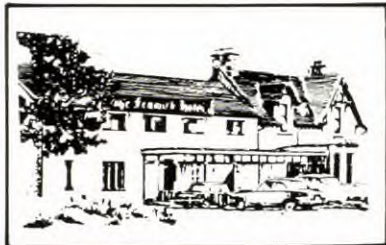
Fenwick Hotel Telephone: Fenwick 478