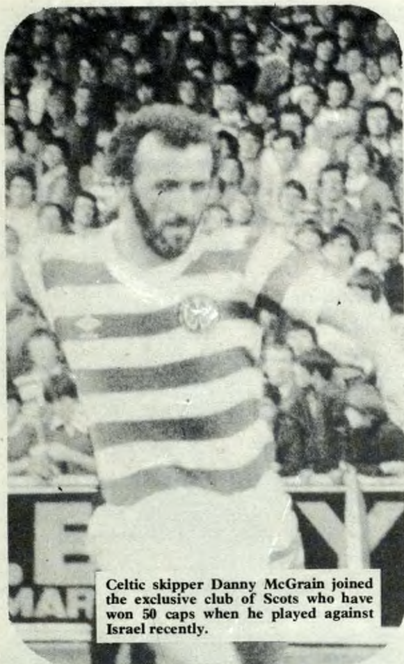
Celtic skipper Danny McGrain joined the exclusive club of Scots who have won 50 caps when he played against Israel recently.