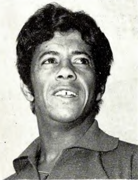
AMARILDO—Fiorentina's explosive star