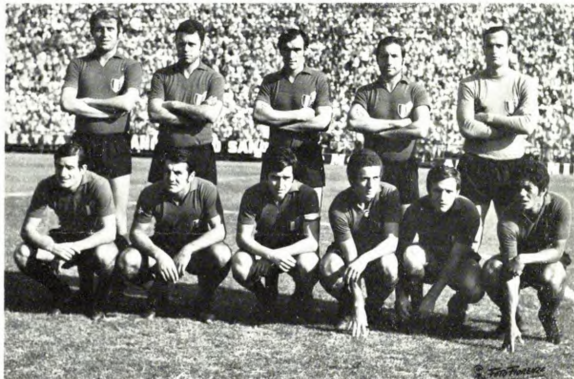
A.C. FIORENTINA—ITALIAN LEAGUE CHAMPIONS, 1968-69