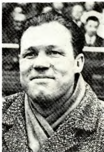
RINUS MICHELS, Coach and Trainer

Amsterdam has often been called the Venice of Northern Europe. It has 50 canals dividing the city into 70 islands linked together by 500 picturesque bridges. You can take a canal tour from Amsterdam Hilton Hotel, where the boys were staying, through this water maze, past 17th century merchants' houses with their unusual gables, to the bustling modern part. Amsterdam is also a city of bicycles—flower stalls—elaborate barrel organs—outdoor cafes where one can spend many a pleasant hour watching the world go by. Amsterdam is also, of course, the diamond centre of the world, given to the art of cutting, grading, etc., and whose jewellery shops are exceptional.