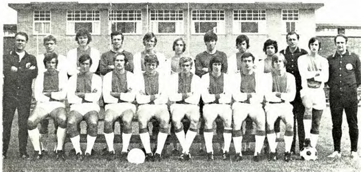
AJAX AMSTERDAM DUTCH LEAGUE CHAMPIONS, 1969-70