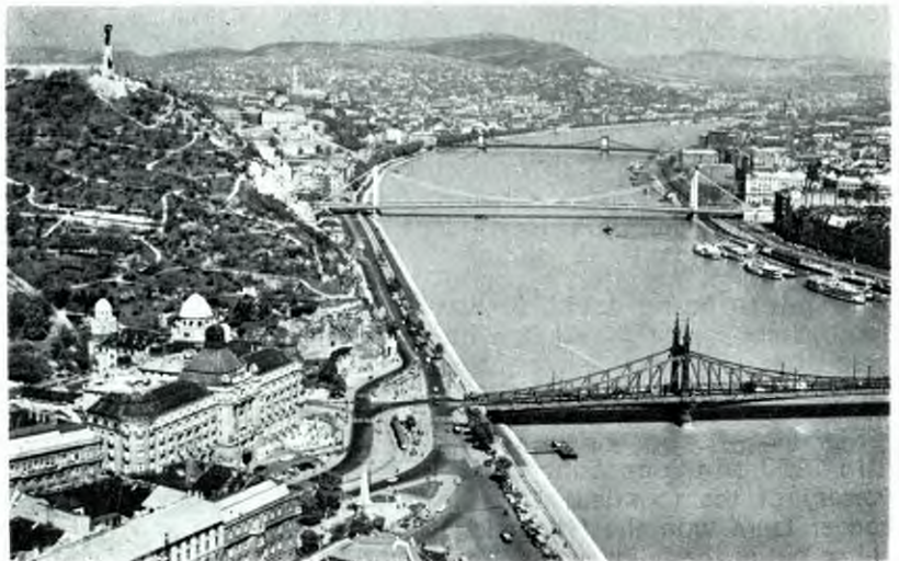
Budapest and the Danube with Gilbert Hotel (where the team stayed) opposite the bridge in foreground.

We are sorry that Richard Burton and Liz Taylor, due to filming commitments, could not attend the match in Budapest. Our jubilant Supporters were treated to an expense is no object party by the Burtons which included unlimited caviare and champagne. Every one of the Celtic fans present were introduced to the famous screen celebrities who mixed freely with our Supporters and entertained them with singing. Liz Taylor was presented with flowers and Richard Burton with a Celtic scarf. The Club has, by letter, personally invited the Burtons to visit us at Celtic Park in August/September when they hope to be over in Britain. We should like to repay in a small way the wonderful hospitality they extended so freely to our Supporters and we have promised that our Supporters will give them a wonderful reception at the Park.