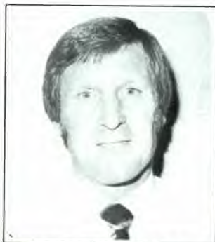
BILLY McNEILL, M.B.E.

that possibly will make it more exciting and provide more entertainment for the spectators. Hearts traditionally have a large support and I would like to welcome you all to Celtic Park this afternoon. No matter the final result I am confident that both teams will provide a good measure of what is good in football.