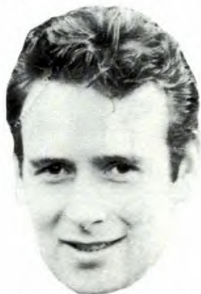
WILLIE WALLACE . . . manager Tommy Gemmell's "right hand man" at Dundee.

"Don't forget though," says manager Gemmell, "that we have had 11 different players getting goals for us. Oh, Billy gets a few, but he's not our only marksman — and that's how I like it. We have our goal ammunition spread around the team."