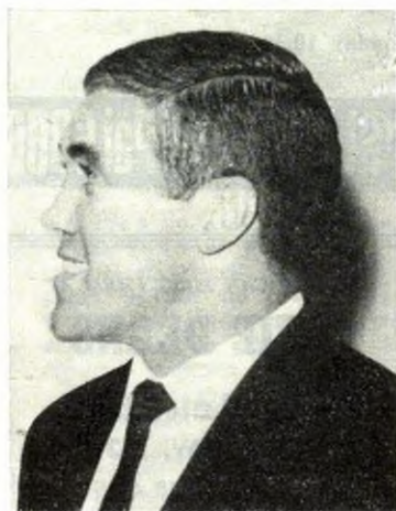
A great Celtic player who became a great Leeds United player — BOBBY COLLINS.