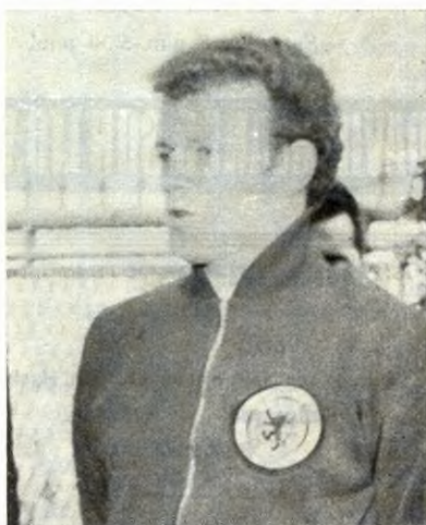
Leeds and Scotland's captain— BILLY BREMNER