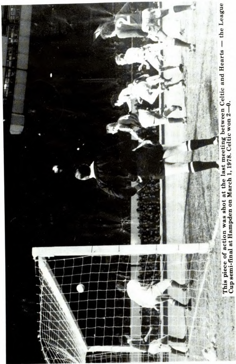
This piece of action was shot at the last meeting between Celtic and Hearts — the League Cup semi-final at Hampden on March 1, 1978. Celtic won 2—0.