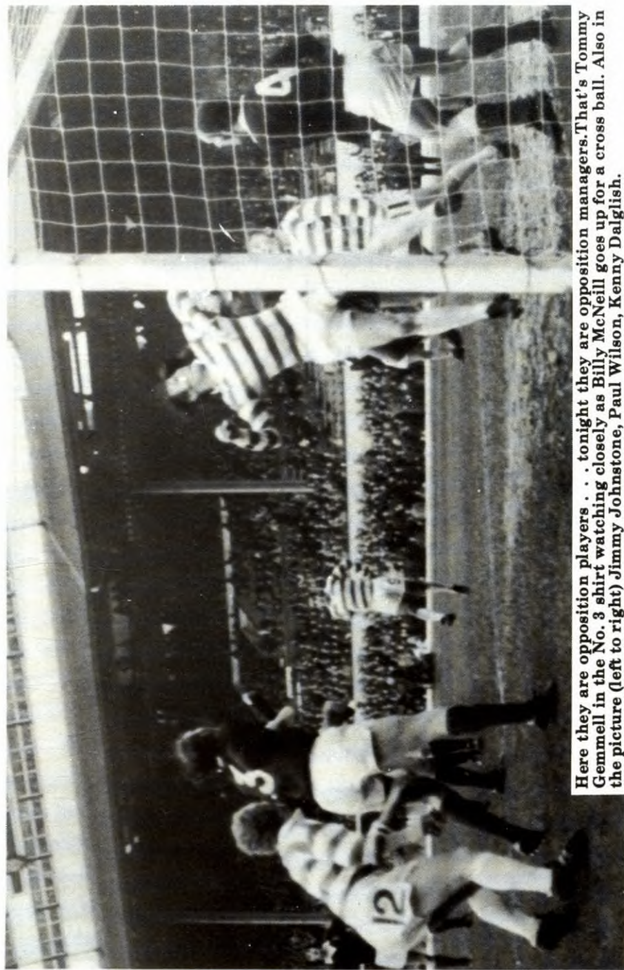
Here they are opposition players . . . tonight they are opposition managers. That's Tommy Gemmell in the No. 3 shirt watching closely as Billy McNeill goes up for a cross ball. Also in the picture (left to right) Jimmy Johnstone, Paul Wilson, Kenny Dalglish.