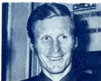
BILLY McNEILL the Celtic skipper and the man who led them to European Cup success in season 1967.

But always skill and flair are the qualities that shine through in these encounters.