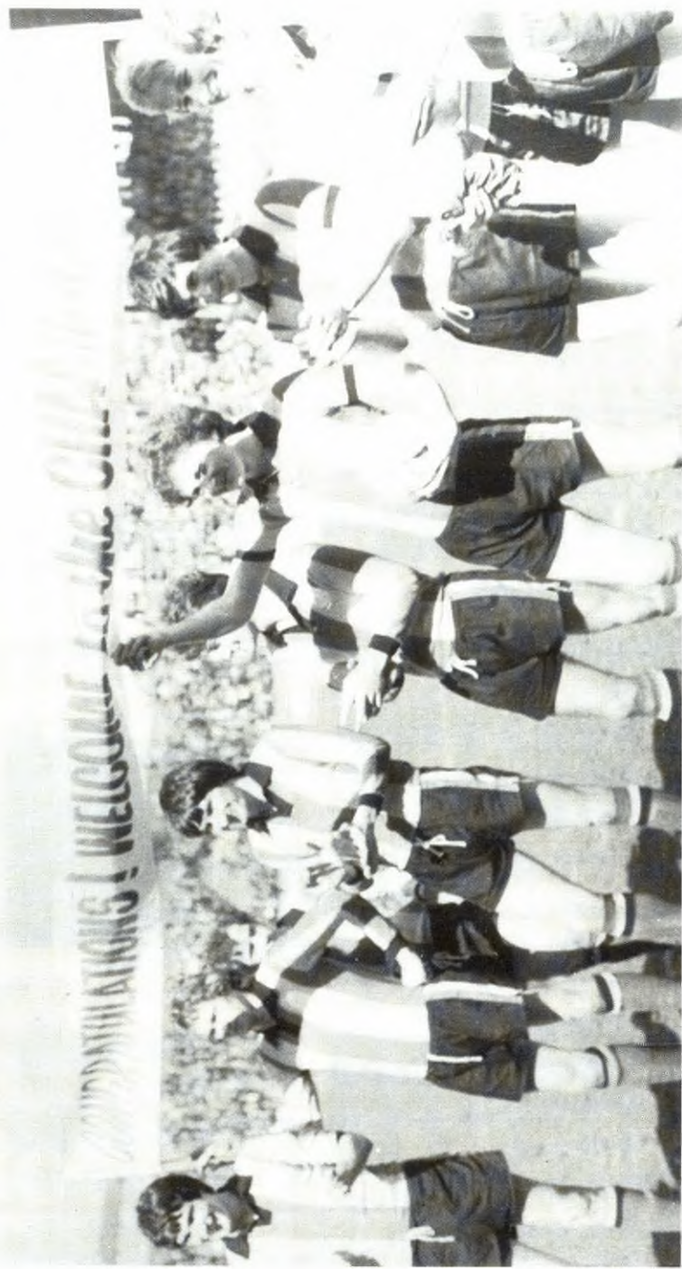
Nice touch, Thistle. The Partick boys, with congratulatory banner, aloft, welcome champions Celtic on to the Firhill pitch before the Premier League game last Saturday.