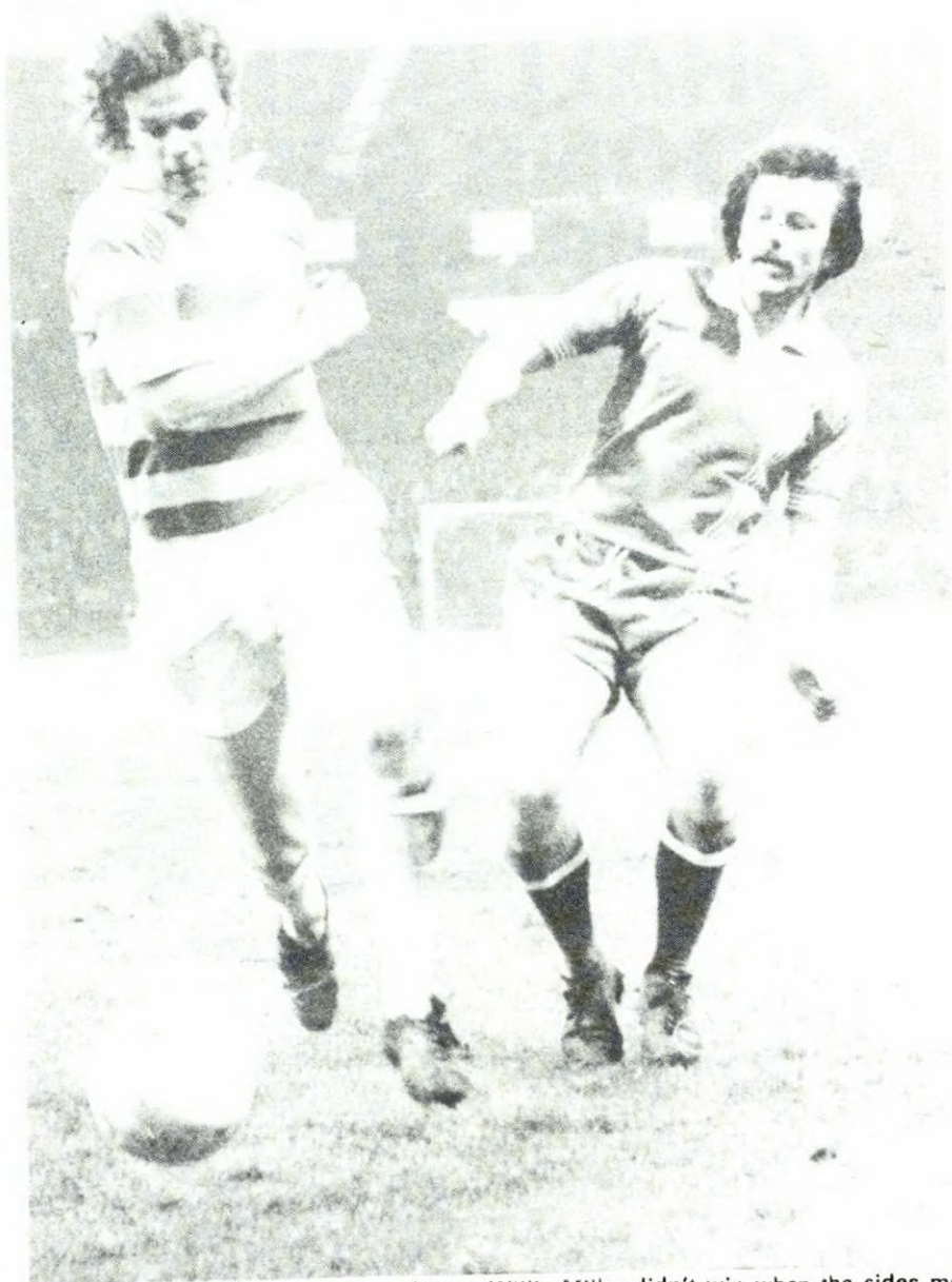
This was one duel that Aberdeen skipper Willie Miller didn't win when the sides met at Parkhead earlier this season. Alfie Conn strides away from his Pittodrie challenge and heads for goal.